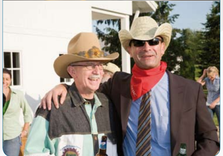
Live Cases (up) – Gala Barbeque Dinner