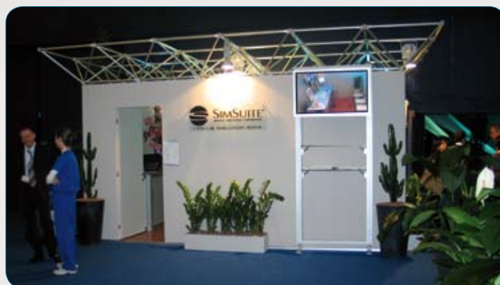
A SIM-SUITE Catheter Simulation System will be available for practical teaching on PFO/ASD closure technique during the Meeting

12.00-12.15 The hybrid approach: the nurses point of view – S. Hill